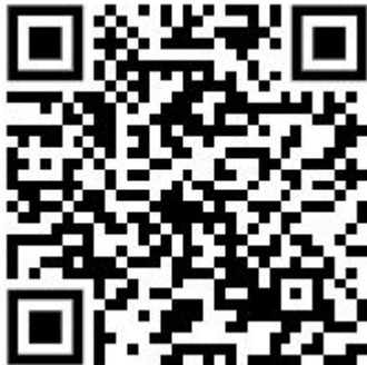
iRis Plus Datasheet