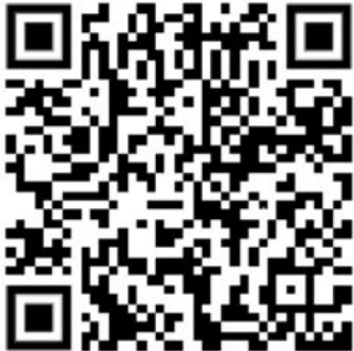
iRis HMI Brochure